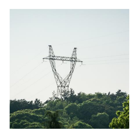
Construction of three single-circuit OHL 220 kV Nishon SS 220 kV SFES-ORU 220 kV Talimarjan TPP