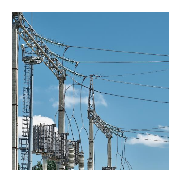
Construction of Turakurgan TPP with taps of OHL 220-110 kV