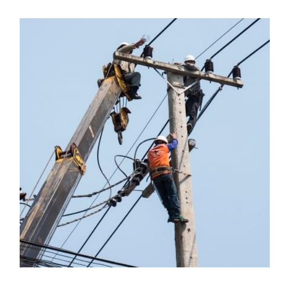
Construction of OHL 220 kV SDTES to SS Zafarobod 220 kV