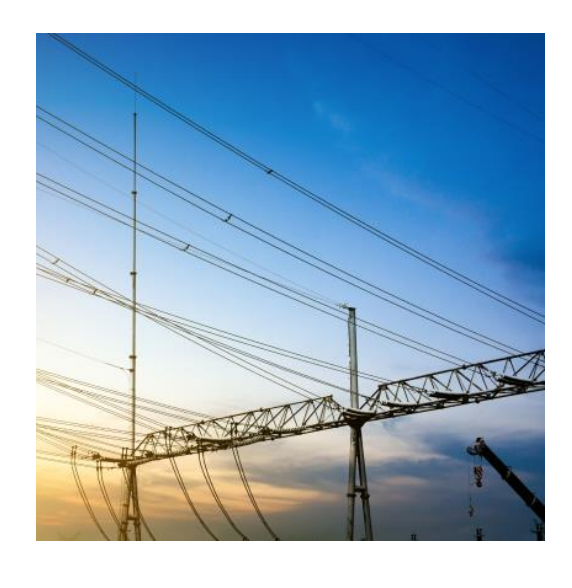
Construction of OHL 110 kV and part of SS Suffa 110/35/10 kV within the project of EPS of tourist recreational zone "Zomin"