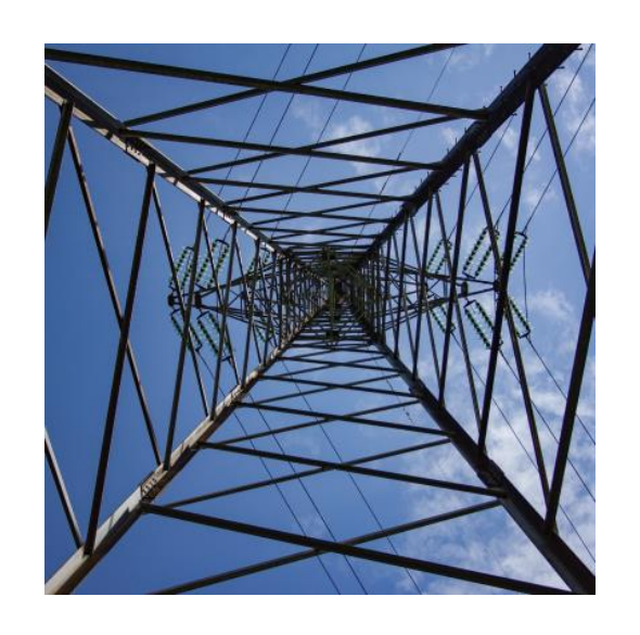
Construction of double-circuit OHL 110 kV within the project "Acceleration of constr-on of EPS facilities of Tashkent Cotton Textile LLC"